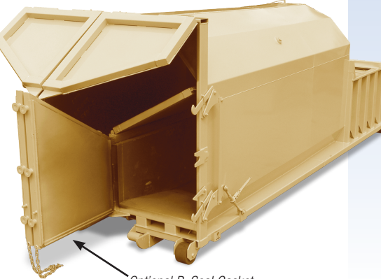
Optional P-Seal Gasket

The Qwik Clean Tank with exclusive Trash Check<sup>™</sup> is a standard feature on the DRC II. It funnels any liquid seepage occurring during compaction into an enclosed area underneath the charge box floor. The liquid is automatically discharged at the disposal site, in effect flushing the container and the area behind the ram.