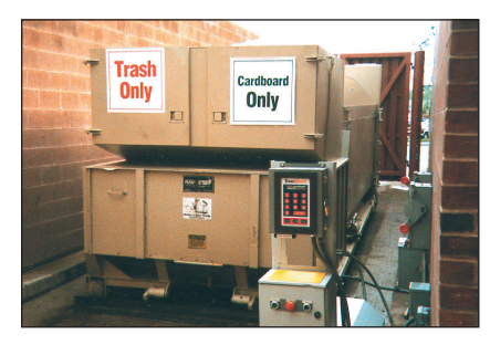
Also available with an advanced system for measuring and reporting container usage and fullness. Users can input an I.D. number to access the compactor.