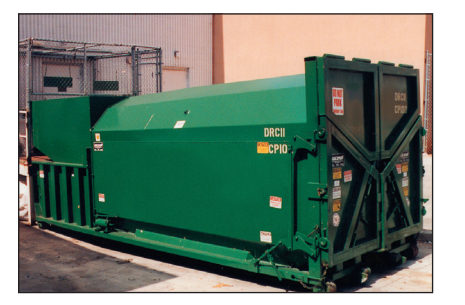
At this large urban department store, the DRC II averages a payload of 5 to 6 tons. Its lockable enclosed hopper, surrounded by a securely fenced loading area, increases employee security and confidence when depositing waste and recyclables for compaction.