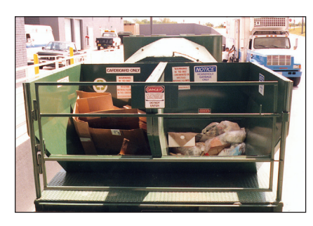
At this large hospital, the DRC II averages 60% trash in one compartment and 40% cardboard in the other compartment. This provides convenience and flexibility with only one unit.