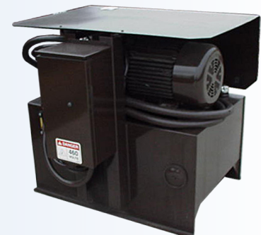
The RJ-575HD features a high-performance remote power unit with a UL and CUL Listed panel box, 30 HP motor, and an external motore starter reset button.